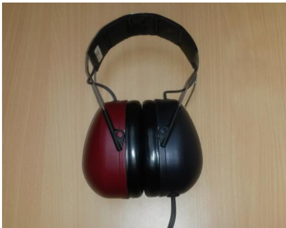
Figure 3: An example of audiometric headphones where the red earphone is placed on the right ear and the blue earphone is placed on the left ear.

Advantages of pure-tone audiometry hearing screening include: